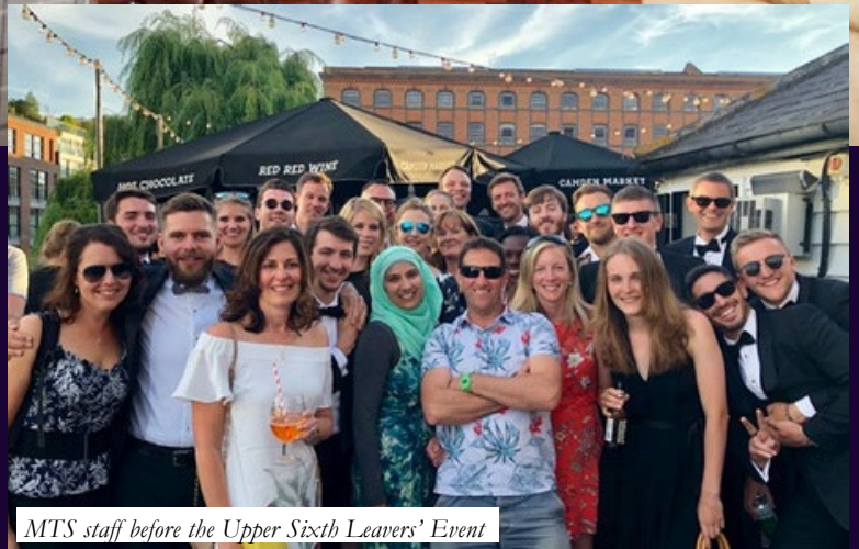
MTS staff before the Upper Sixth Leavers' Event

There are various trips which are organised throughout the year such as a staff ski trip and an annual pre-Christmas trip to Harrods. There are also many popular events run by Parents Associations such as the summer barbecue by the lake, a rugby dinner & dance, a Burns Night supper and concerts which staff are most welcome to attend.